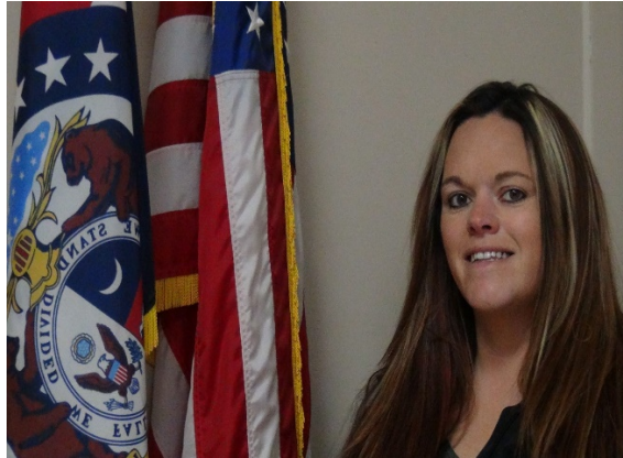
Institutional Activities Coordinator Department of Corrections