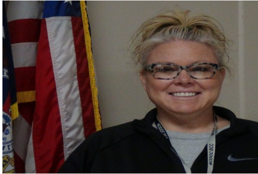
Corrections Case Manager II Department of Corrections