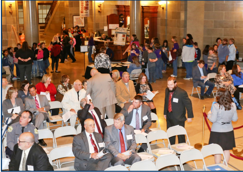
Winning team members and guests gather in the Capitol Rotunda for the 2014 GAQP.

On Thursday, October 30th, winning team members and their guests, along with state officials and dignitaries gathered in the Capitol Rotunda for the 26th Annual Governor's Award for Quality and Productivity.